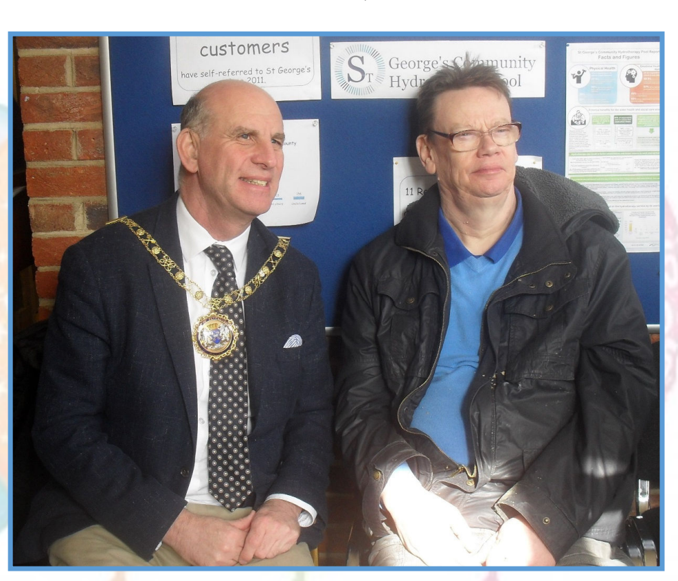
The Mayor with a pool user.