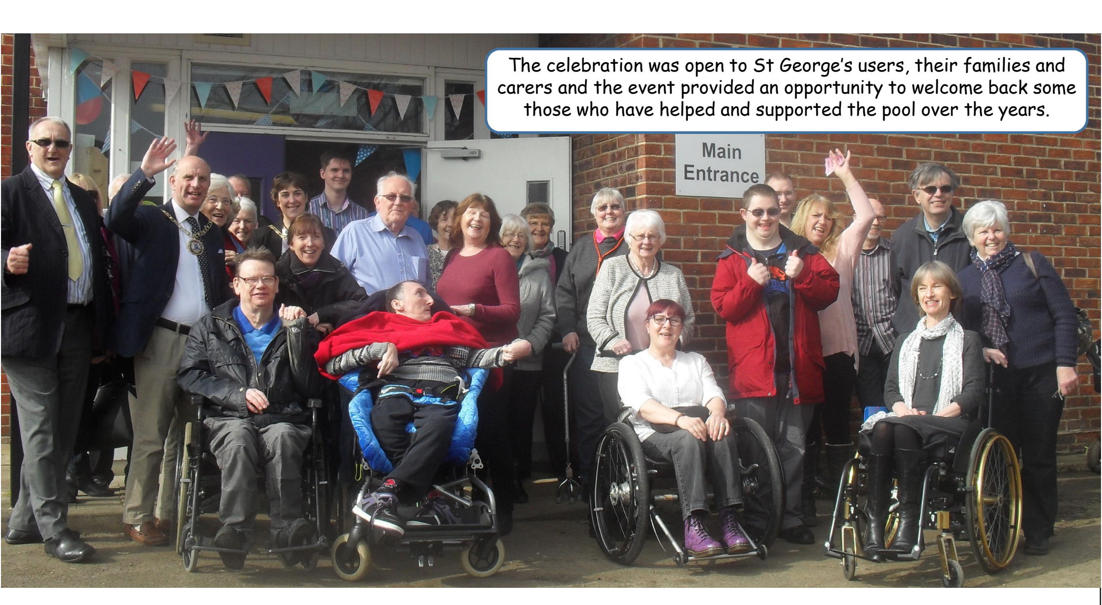
Here we capture some moments from the day...