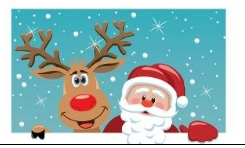
Caverstede Christmas Fayre

Children love to choose a book to take home and can scan their book out themselves with the special barcode system!